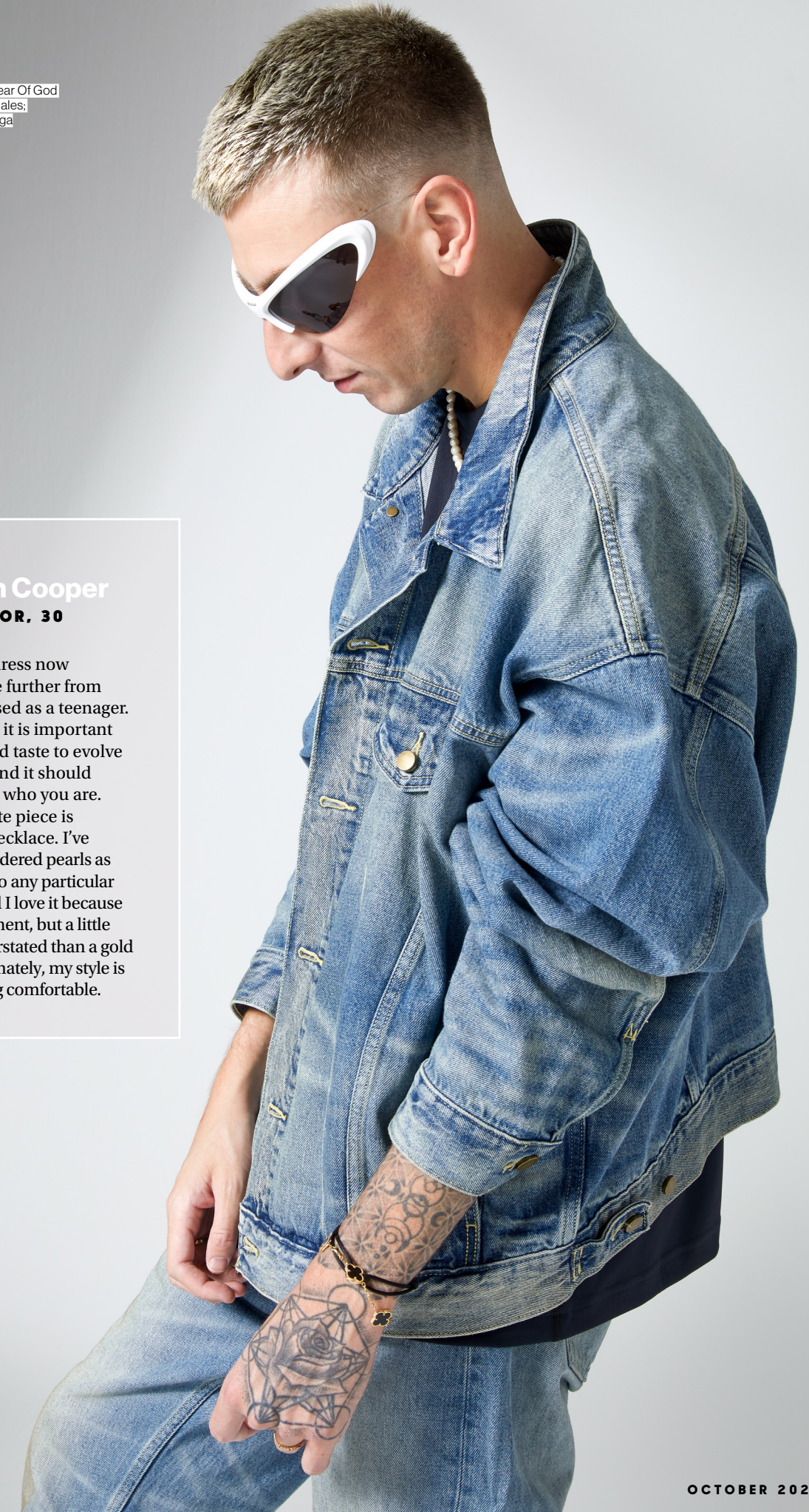
Jacket, Jeans both by Fear Of God Essentials at Bloomingdales; Sunglasses by Balenciaga