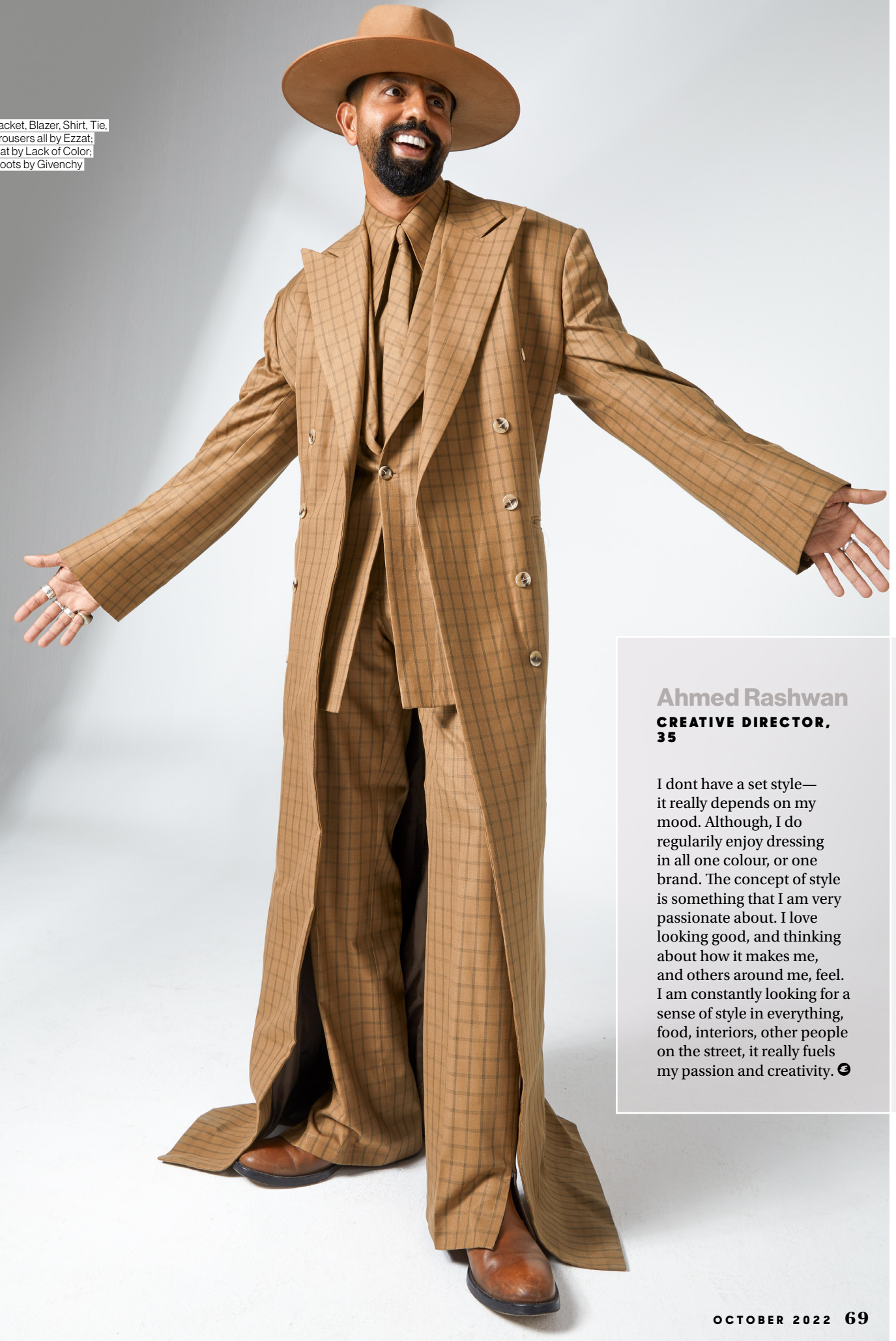
Jacket, Blazer, Shirt, Tie, Trousers all by Ezzat; Hat by Lack of Color; Boots by Givenchy