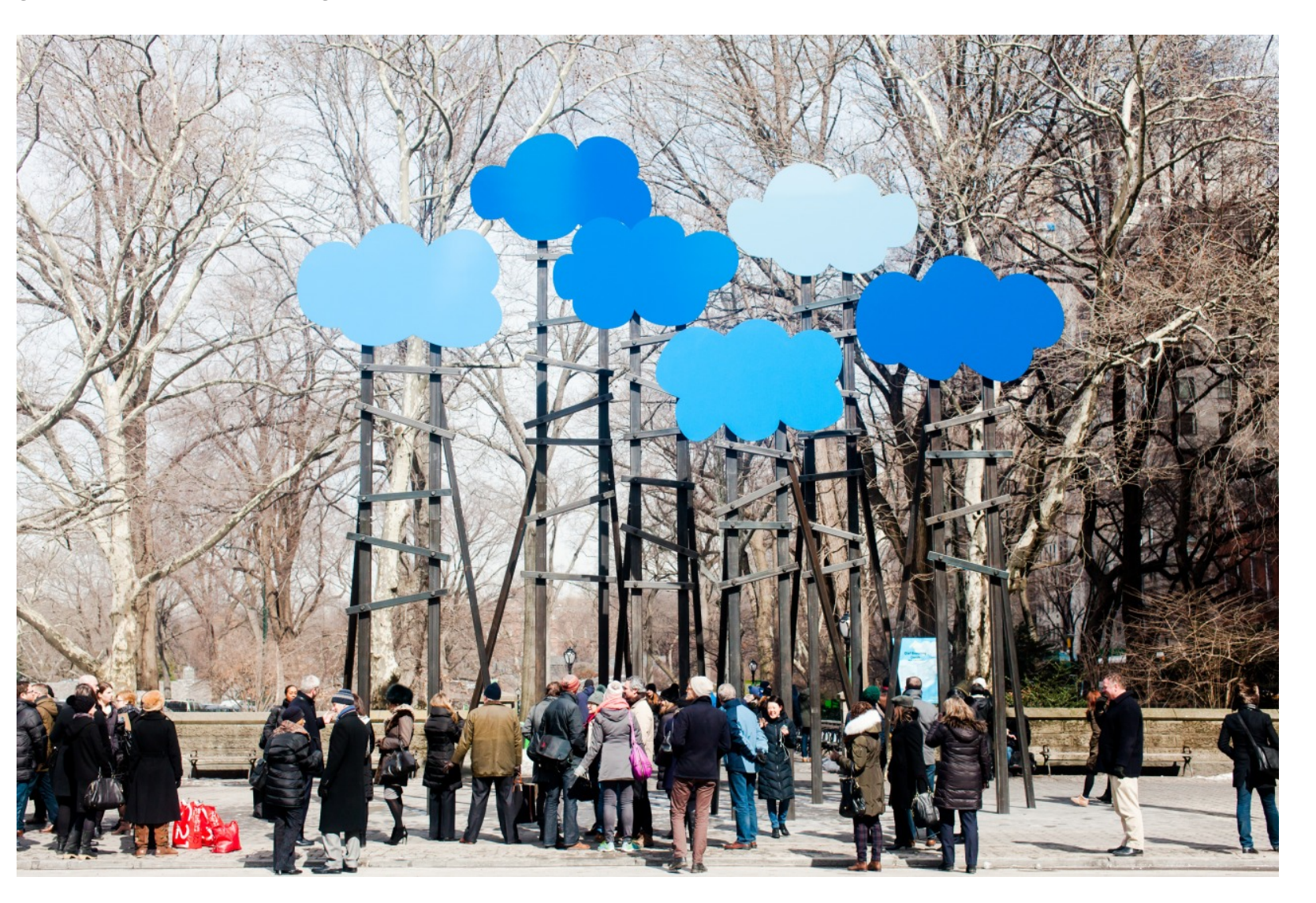
CLOUDS, NEW YORK CITY, PUBLIC ART FUND, STEEL AND ALUMINUM