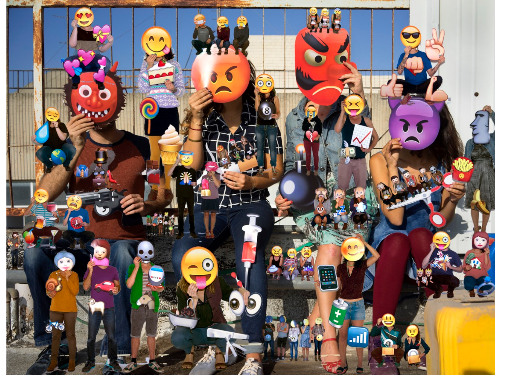
© Olaf Breuning, 2014, EMOJIS, C-PRINT, 120 CM X 150 CM

But I am very happy that I have finished with this theme. I spoke about emojis. Now it's over and I am happy I did it like that. It worked for me as a set of photos, because it tells a lot of stories and there are a lot of different people in it. I will never really talk about it again. But I am happy that I did.