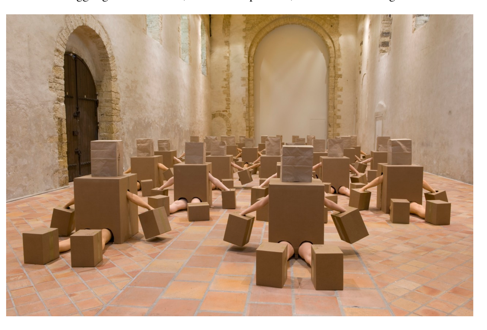
© Olaf Breuning, 2010, "CAN SOMEONE TELL US WHY WE ARE HERE?", CARDBOARD, CLAY

maybe I am getting slower now, because of age. I always challenge myself to do something new. And it gets more difficult, but I have only one brain. I have reached my capacity for renewing myself, but at the moment I am working on a show for Metro Pictures for next year and I really hope I can come up with something new. I am struggling more to find it, but I like to produce, to do different things.